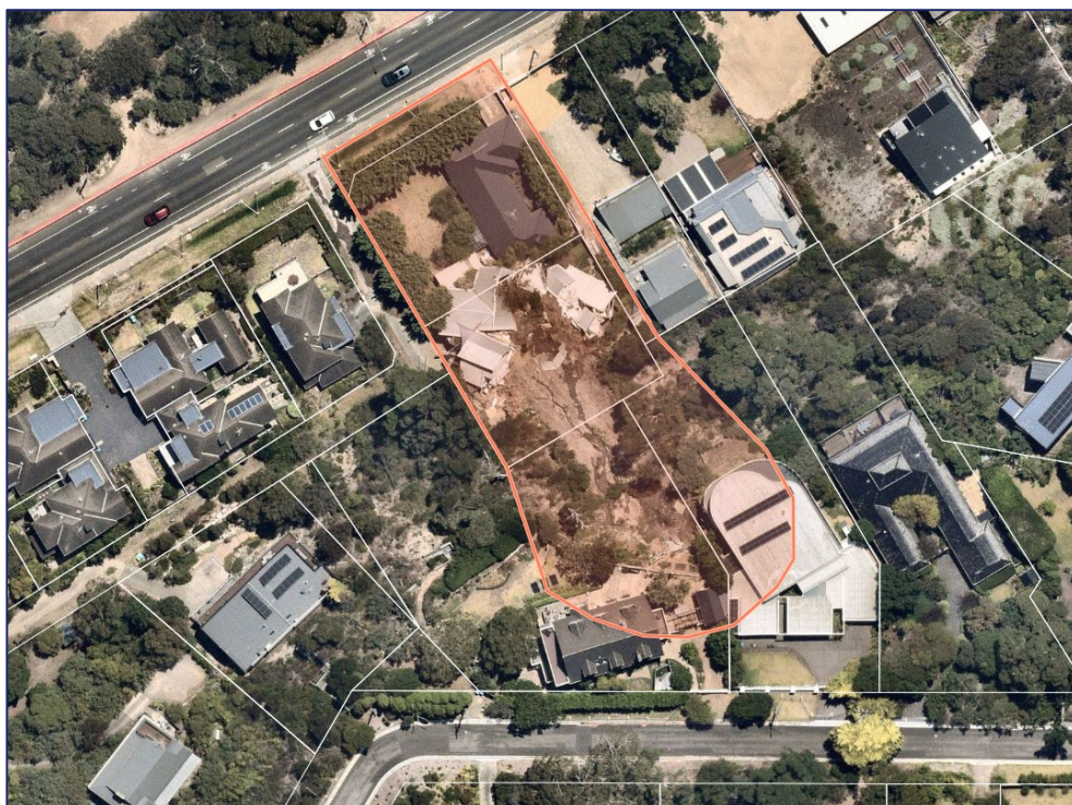
Inset 2: Area requiring in person critical monitoring and inspection highlighted in orange.